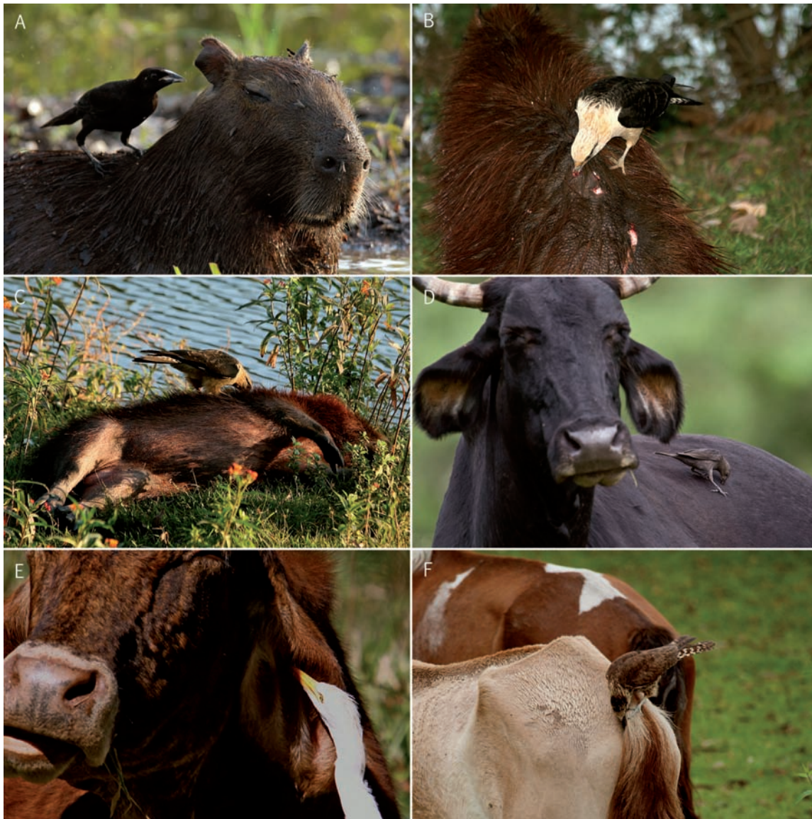
FIG. 1. Selected Brazilian cleaner birds and their hosts. (A) Its head covered with mud, organic debris, and flies, a Capybara is attended by the Giant Cowbird that deftly hunts flies attracted to this host. (B) Gashes on a Capybara's back and rump (due to aggression by dominant individuals) are sought by the Yellow-headed Caracara, which may capitalize on blood and wounded or dead tissue while picking ticks. (C) Posing or facilitation behavior is usual for Capybaras during tick-picking sessions by a cleaner, here the Yellow-headed Caracara. (D) Holding its grasp on a ruminating bovine ( Bos taurus ), a female Shiny Cowbird removes a tick from the host. (E) Close to a resting and ruminating bovine, the Cattle Egret deftly removes a tick from within the ear of this host. (F) Holding its balance on the tail of a grazing Horse, an immature Yellow-headed Caracara removes a tick from its client's rump.

bill morphology (and possibly body size as well), could have played a role in the number of partner species each cleaner visited. However, no bird cleaner in South America or other parts of the world (Sazima and Sazima 2010, Sazima 2011) is as dependent on herbivorous ungulates as the specialized African tick-picking and blood-drinking oxpeckers ( Buphagus spp.), the epitomes of tickbirds (Weeks 1999, 2000; Craig 2009). Their South American rough equivalent would be the Yellow-headed Caracara (Sazima 2011), the cleaner bird for which we recorded the highest number of host species.